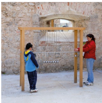
Order No. 10.11000 Impulse Spheres with frame made of wood (only on request).