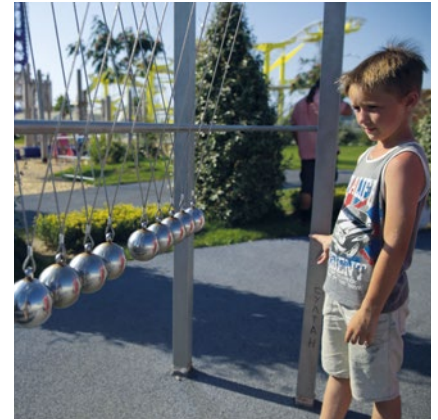
Order No. 10.11010 Impulse Spheres