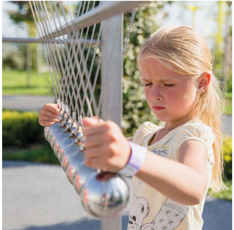
Order No. 10.11010 Impulse Spheres