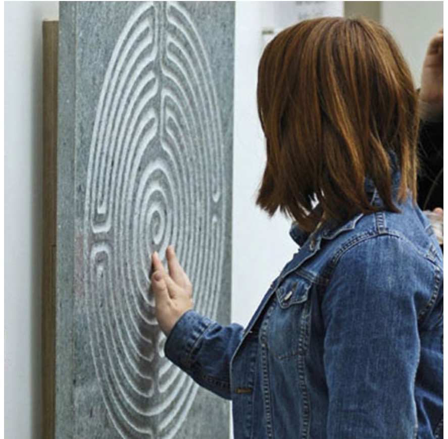
Order No. 10.14500 Fingerlabyrinth for wall attachment

Fingerlabyrinth for wall attachment Fingerlabyrinth with stand frame made of stainless steel graubner Play Stations for Developing the Senses