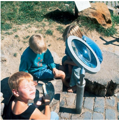
The picture shows the magnifying lens without table.