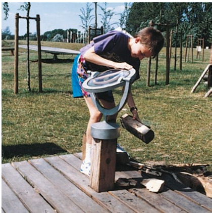
The picture shows the magnifying lens without table.