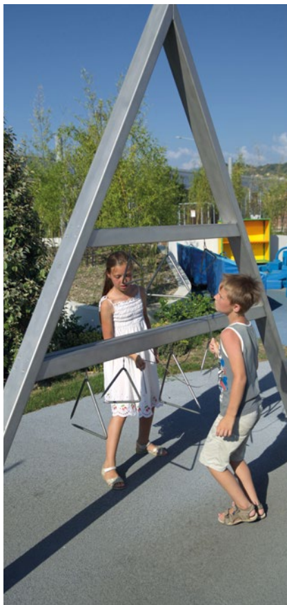
Special version made of stainless steel