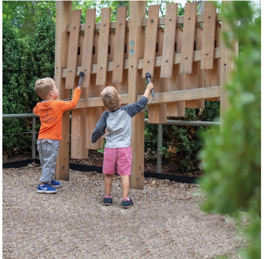
Order No. 10.53002 Dendrophone - double field, Photo © Daniel Perales