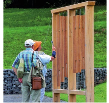
Order No. 10.53102 Tubular Dendrophone - double field