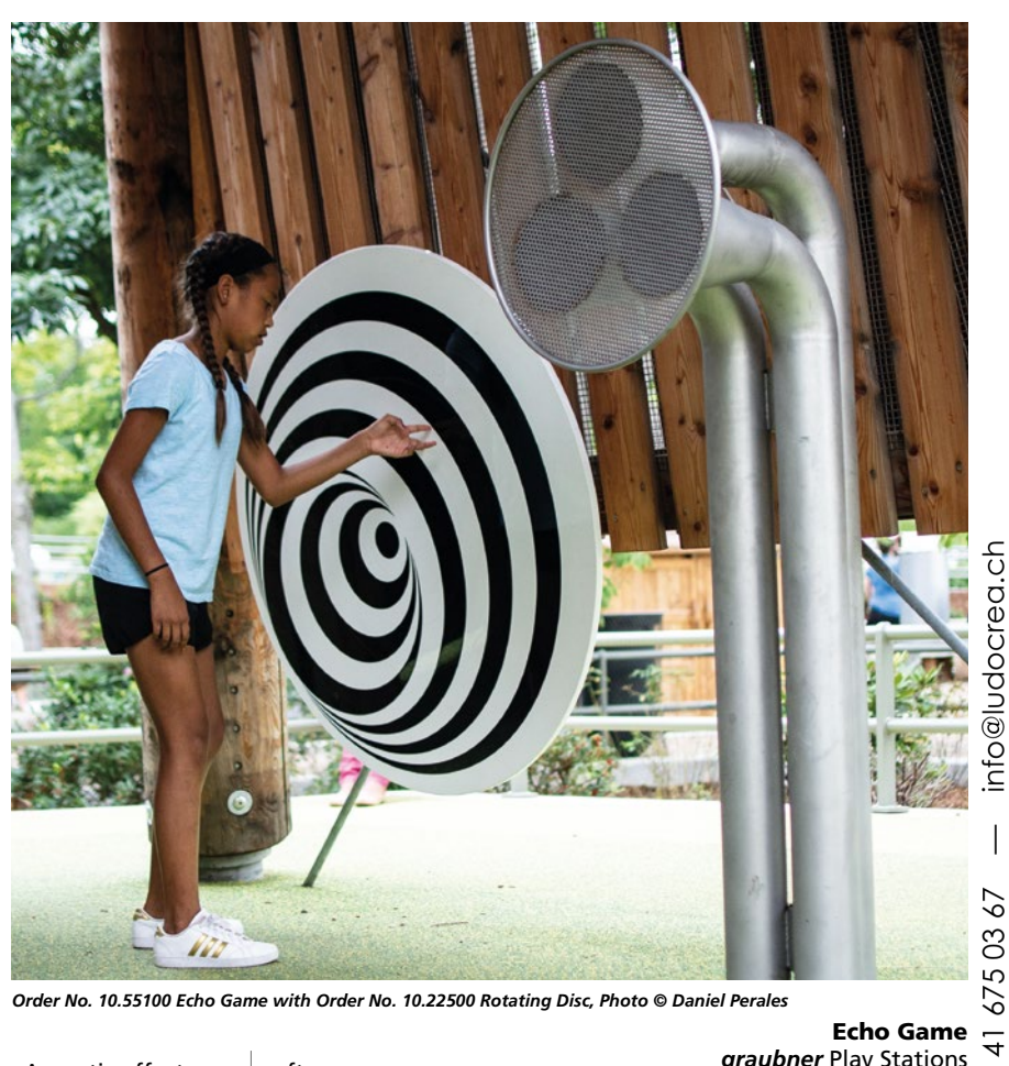
Order No. 10.55100 Echo Game with Order No. 10.22500 Rotating Disc