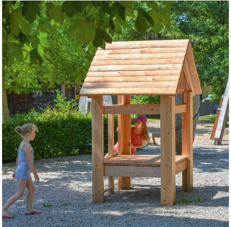
Order No. 3.14230 Toddler's Platform Hut with roof