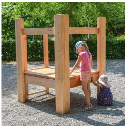
Order No. 3.14200 Toddler's Platform Hut