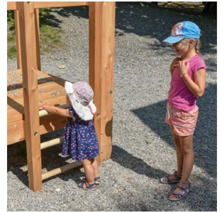
Order No. 3.14200 Toddler's Platform Hut