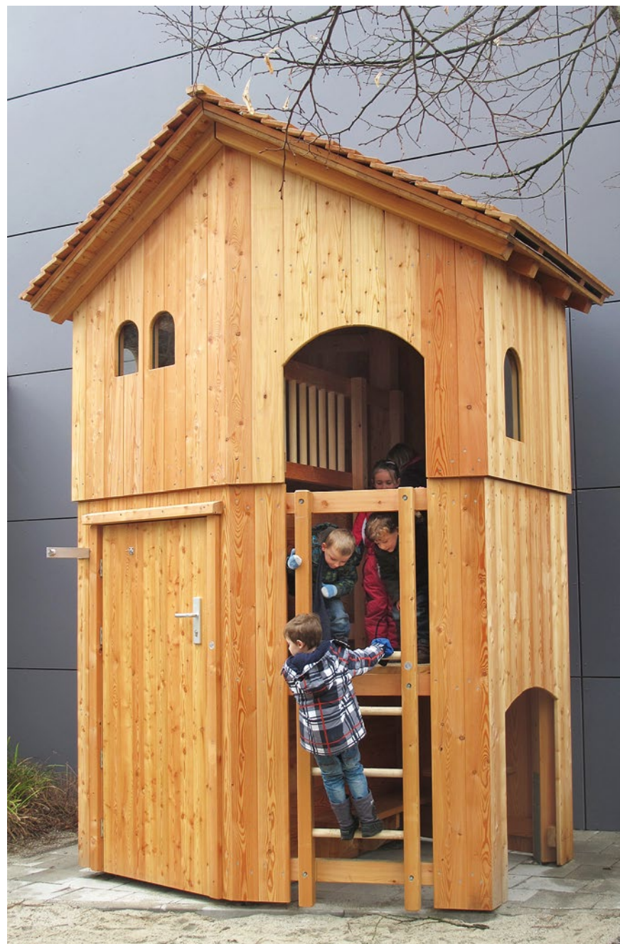
Hexagonal Tower with lockable equipment room