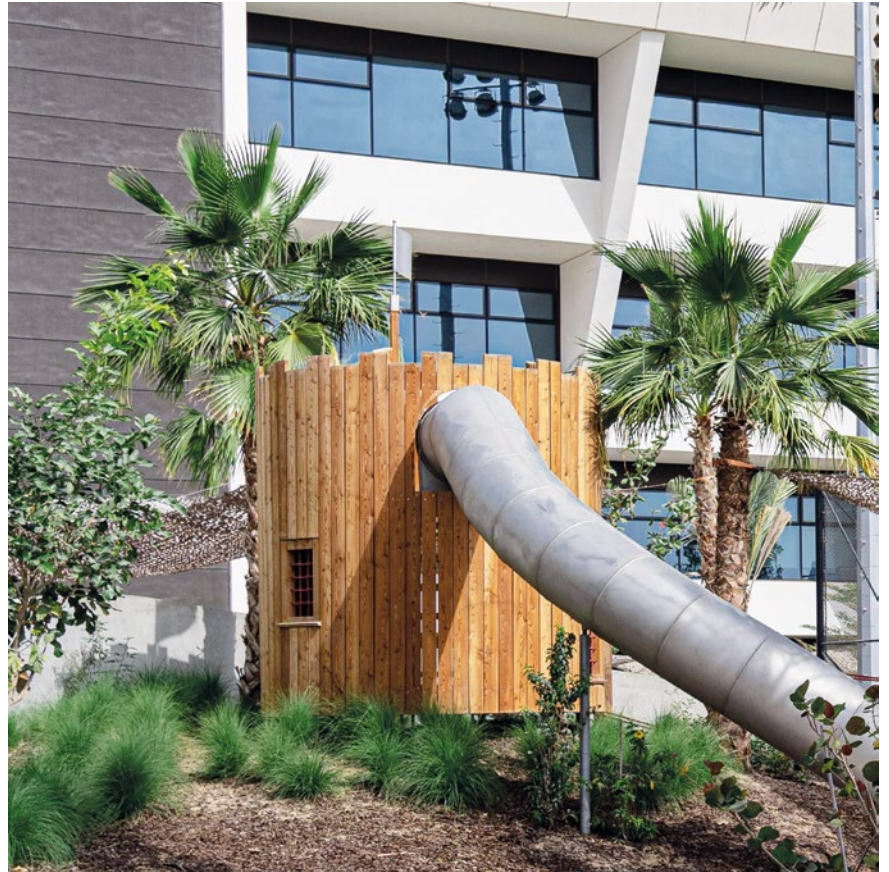
Special version with slide