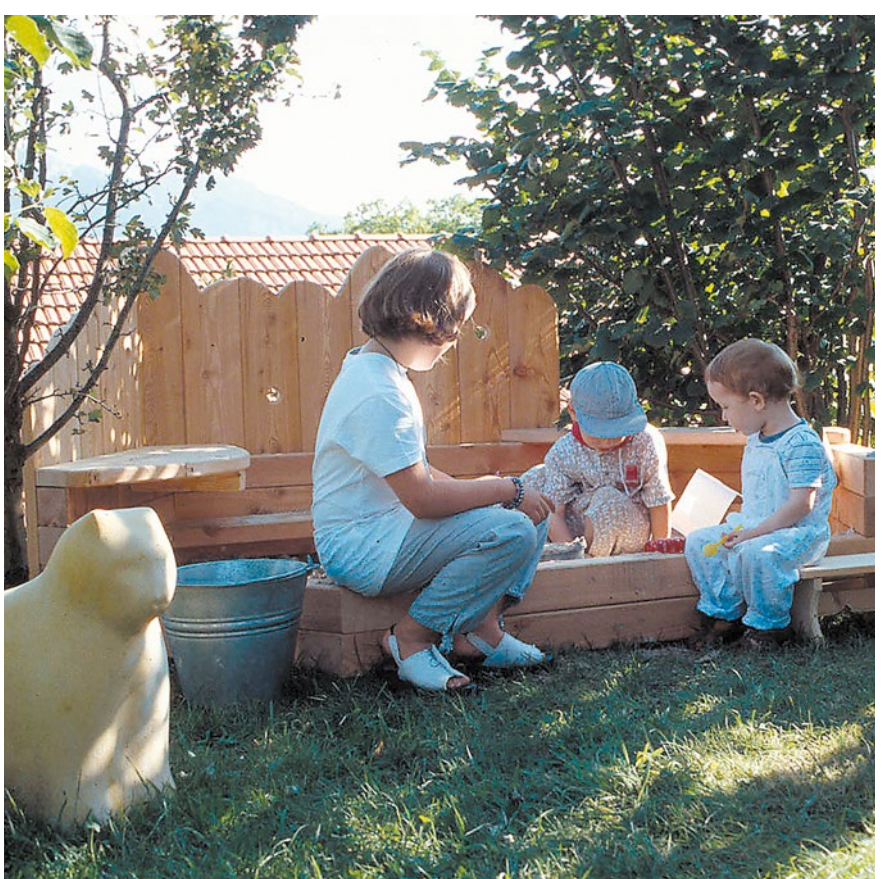
Small Trolls Sand Pit