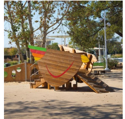
Special version with ramp and stairs

The likeable appeal of the chicken plays a role in creating a play environment which is favourable for children. The coloured design immediately attracts children to play. The net in the stomach is a small meeting place where children can come to find seclusion.