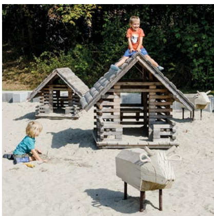
Smallest Playing House