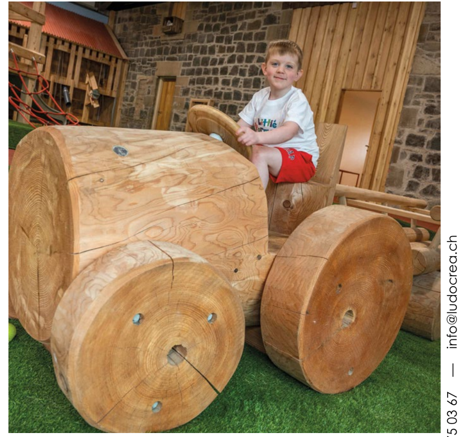
Order No. 4.24000 Tractor with Order No. 4.24010 Trailer for Tractor