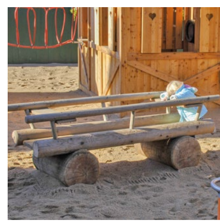
Order No. 4.24010 Trailer for Tractor