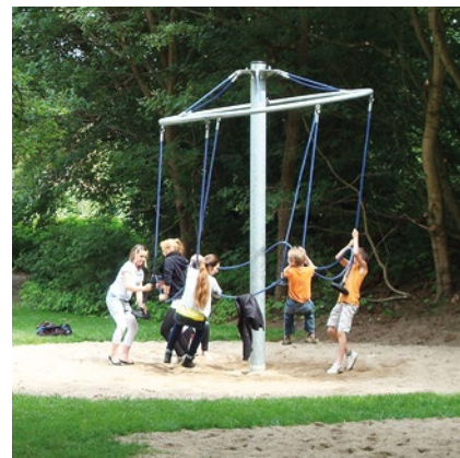
Standard colour rope: blue.