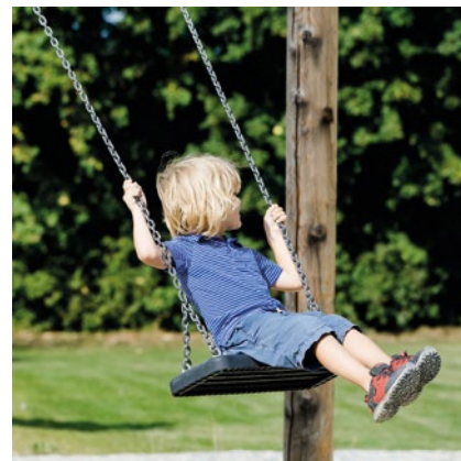
Order No. 6.12820 Multi-surface Twin Swing special