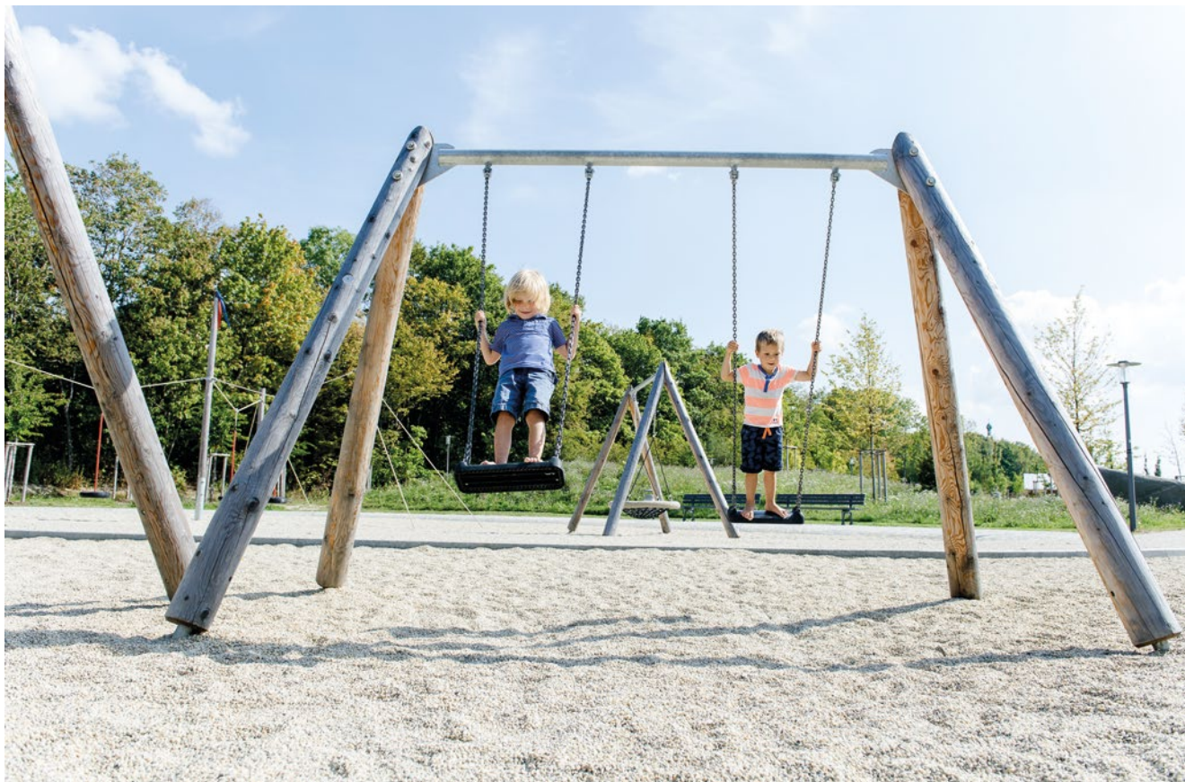
Bolting of cross beam technically modified