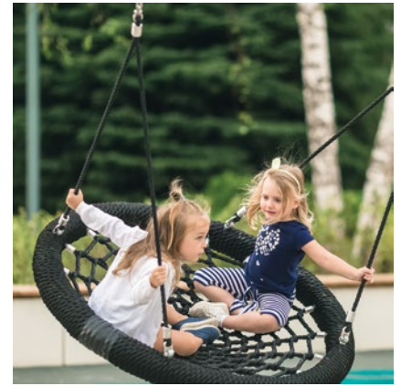
Special colour, Photo © Anton Donikov