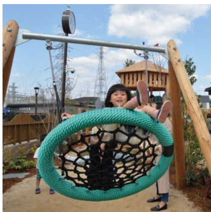
Special colour, Photo © Ayumi Nakanishi