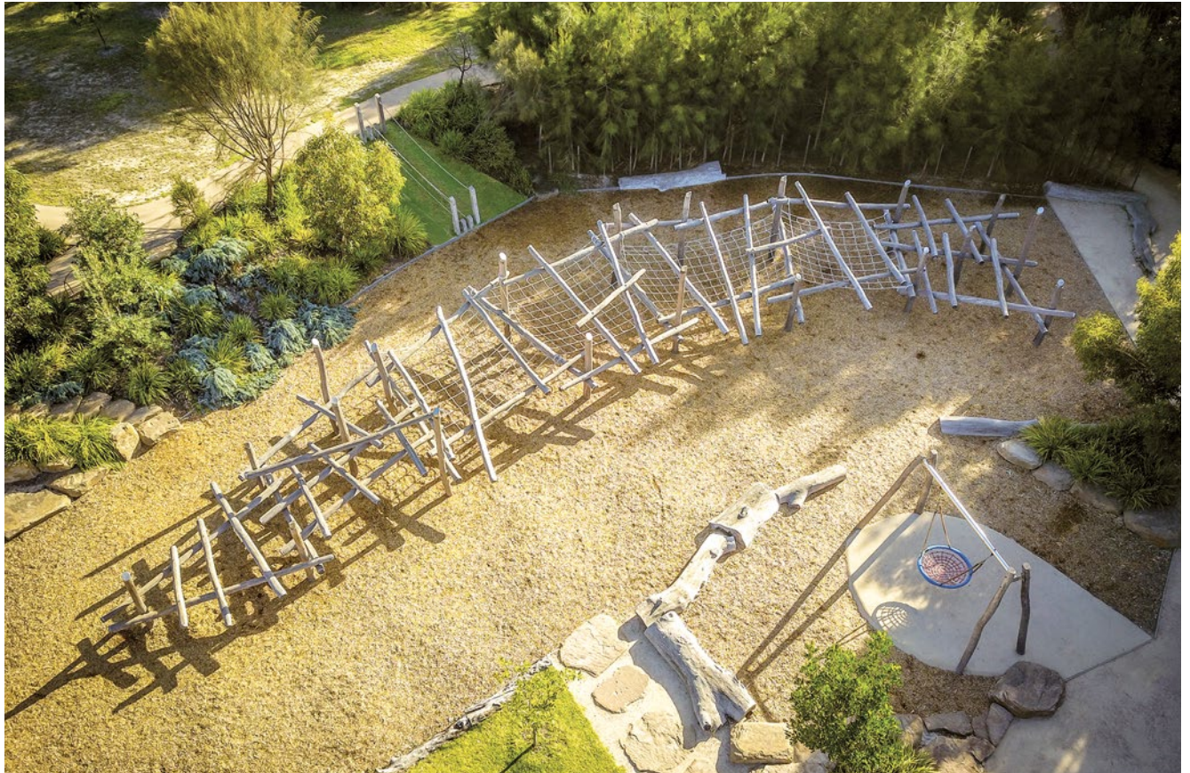
Special version with rings and caps, Photo © Tristan Filippone