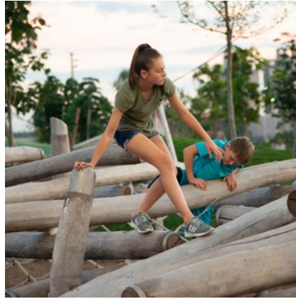
Special version with rings and caps, Photo © Daniel Perales

Climbing Structures made from hand-processed irregular round logs, can be integrated into a strongly nature-oriented environment due to their formal expressive character. Many children can play within a small space; Climbing Structures can even absorb the arrival of a large number of children who wish to play on it and incorporate all of them within a flowing play rhythm. Climbing Structures do not only allow for climbing, experiencing height, and for having a sensual experience with hands and feet, but they can also be used as a nice seat for relaxing and observing.