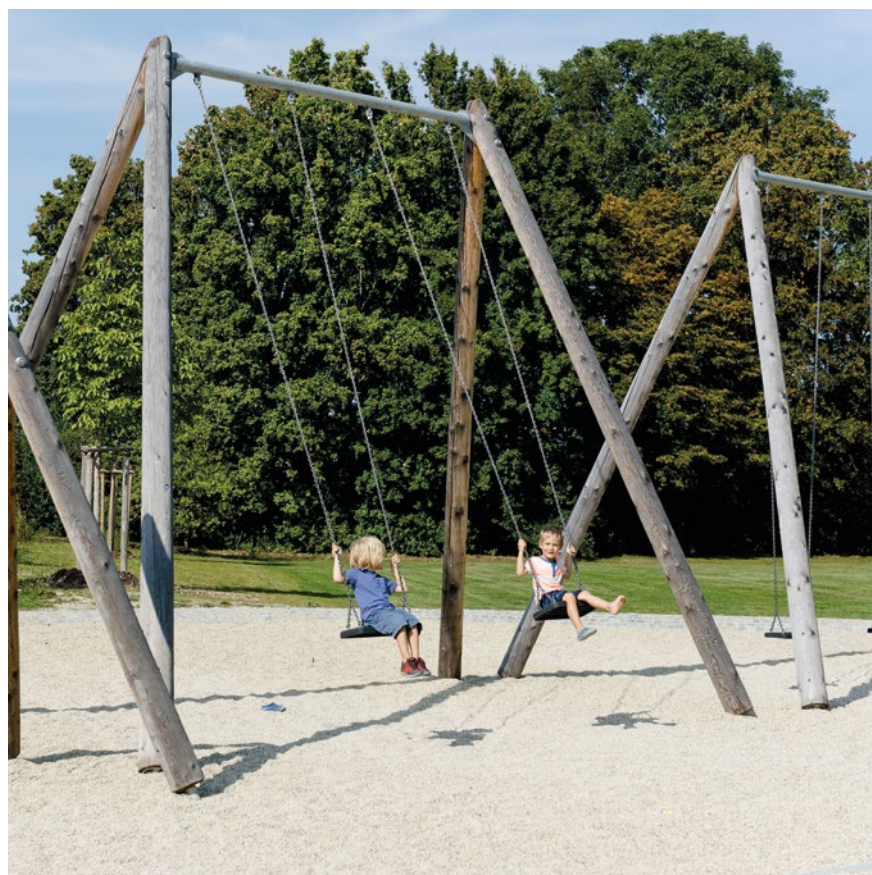
Order No. 7.14020 Extra High Twin Swing special

Extra High Twin Swing special Extra High Swing special