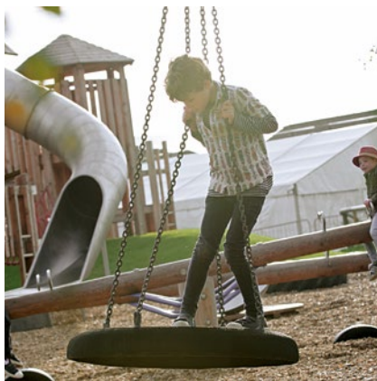
Tractor Tyre Swing