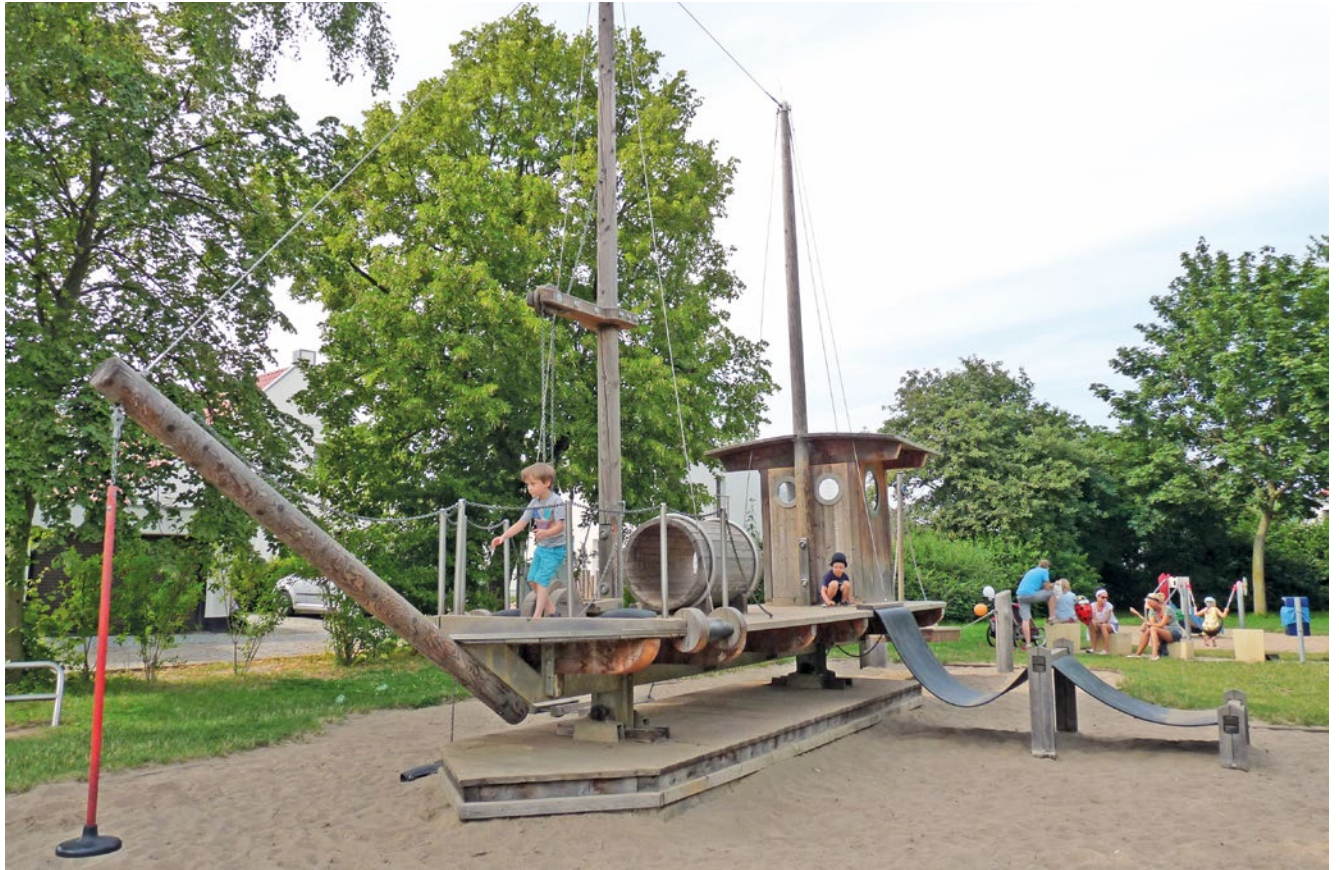
Access option: Order No. 8.03101 Belt Path for Cutter