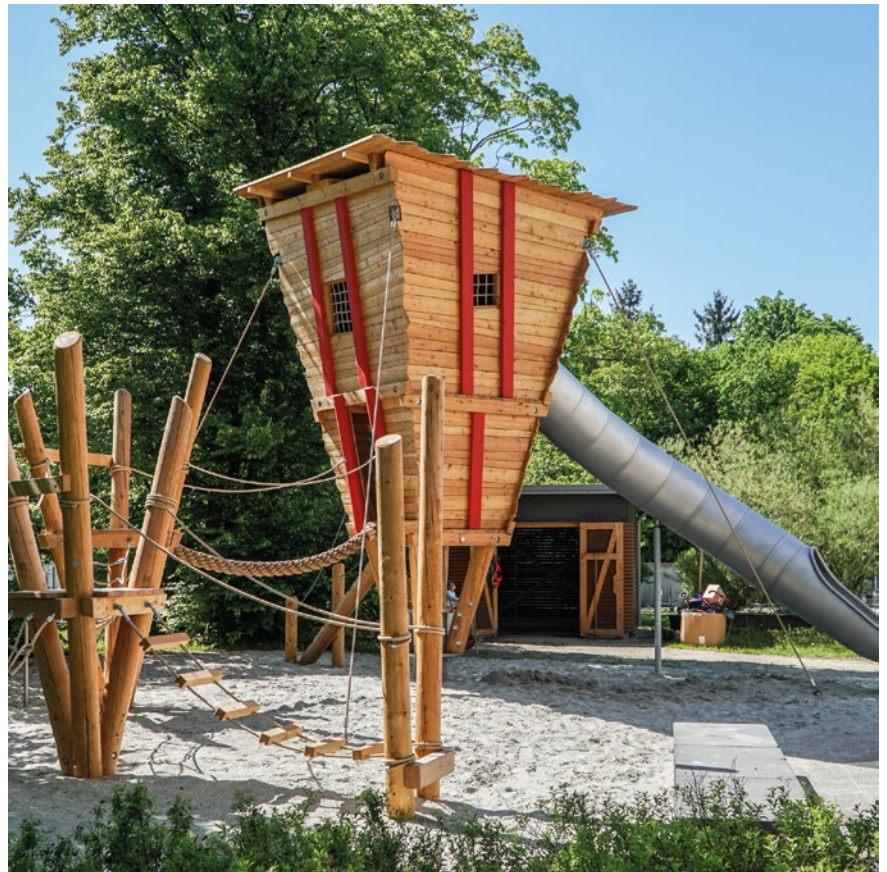
Coloured design against surcharge