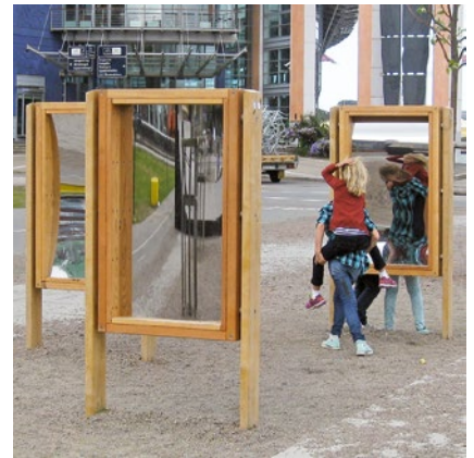
Order No. 9.10600 Distorting Mirror