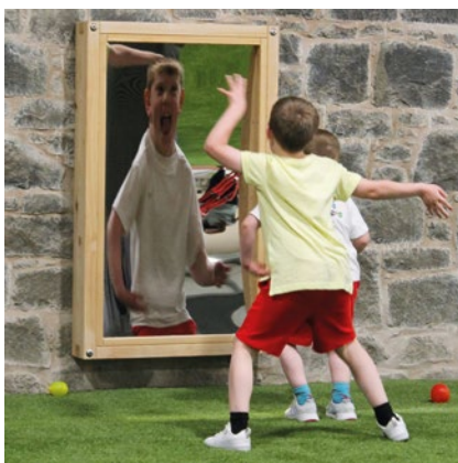
Order No. 9.10500 Distorting Mirror for wall attachment