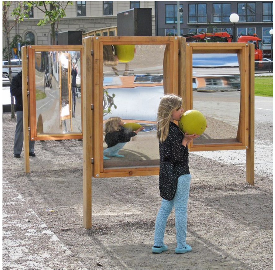
Order No. 9.10600 Distorting Mirror