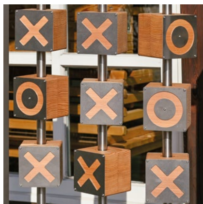
Tic Tac Toe