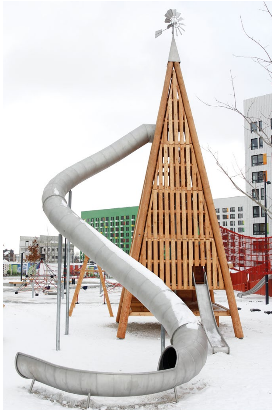
Small Pyramid Tower Middle Pyramid Tower Midsized Pyramid Tower Big Pyramid Tower