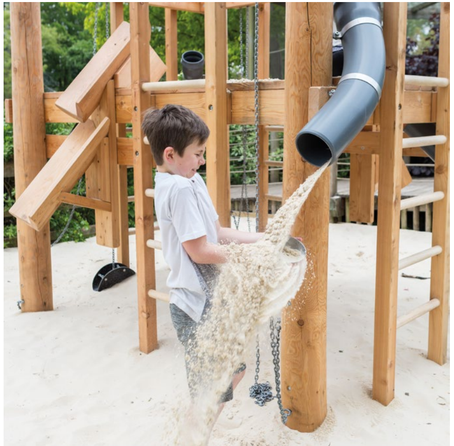
Order No. L5.01010 Building Site larch version, Photo © Barbara Evripidou