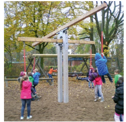
Order No. 6.10101 with stainless steel support frame