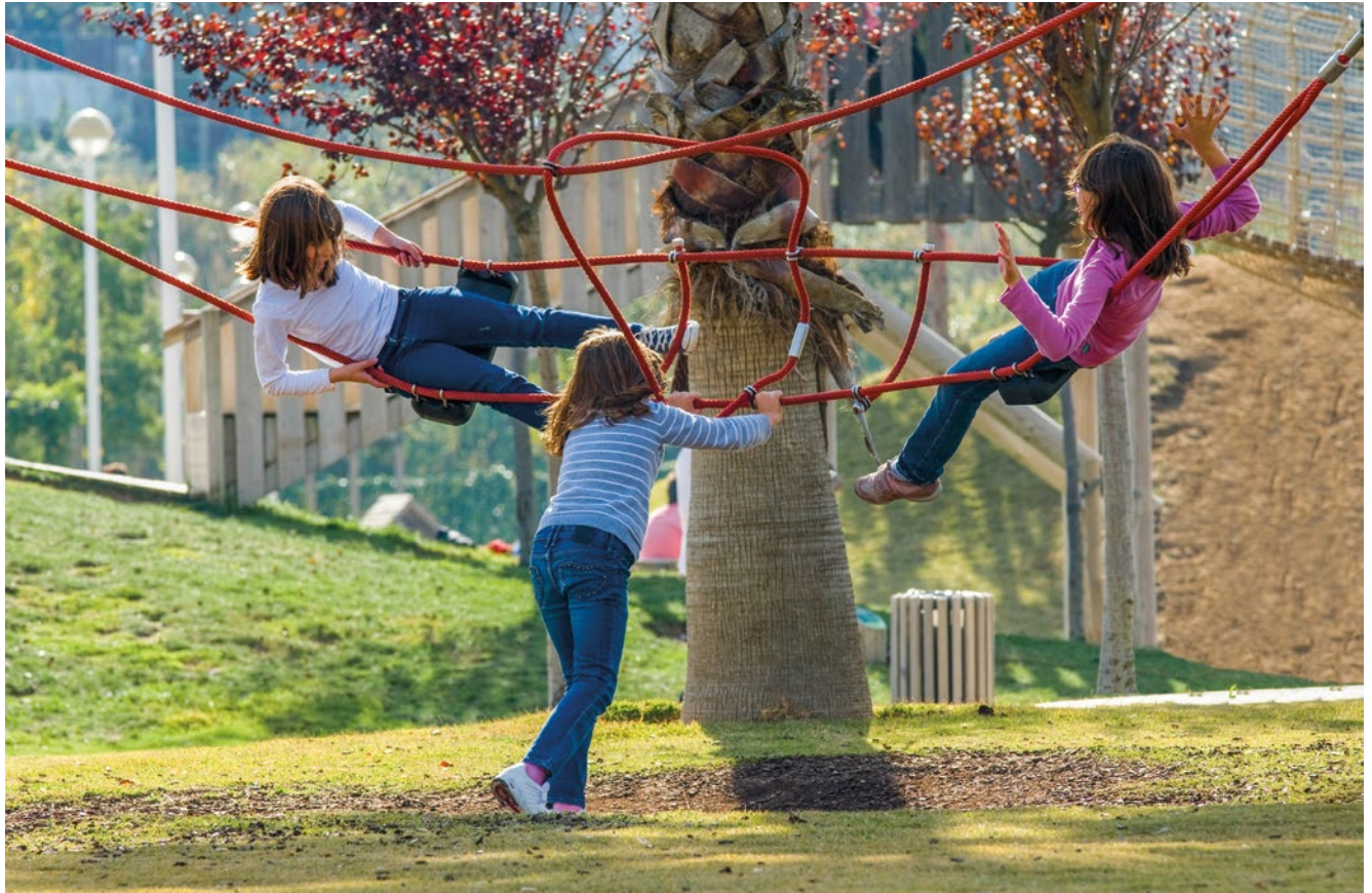
Order No. L6.43000 / L6.43100 Double Hammock Seat