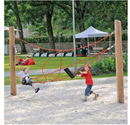
Order No. L6.43000 / L6.43100 Double Hammock Seat