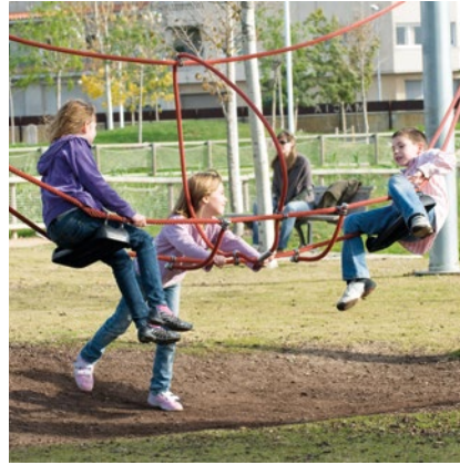
Order No. L6.43000 / L6.43100 Double Hammock Seat

This friendly swing equipment is especially fun for two. Children can swing each other and talk in relaxed pose, almost like in a hammock. More energetic swinging is also possible however, and the unusual lying posture when swinging, increases the pleasure. Thanks to additional transverse webs made from rope, the Double Hammock Seat is also suitable for use in nursery schools. The Quadro Hammock Seat is an amusing alternative offering the possibility of additional play opportunities.